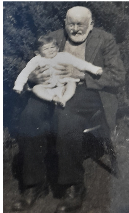
James Rigg