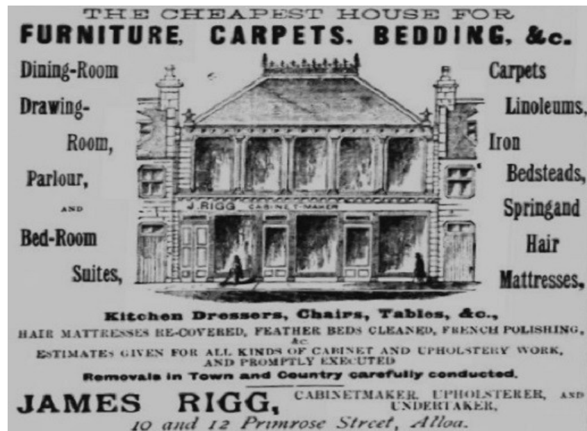
The James Rigg Premises in 1894